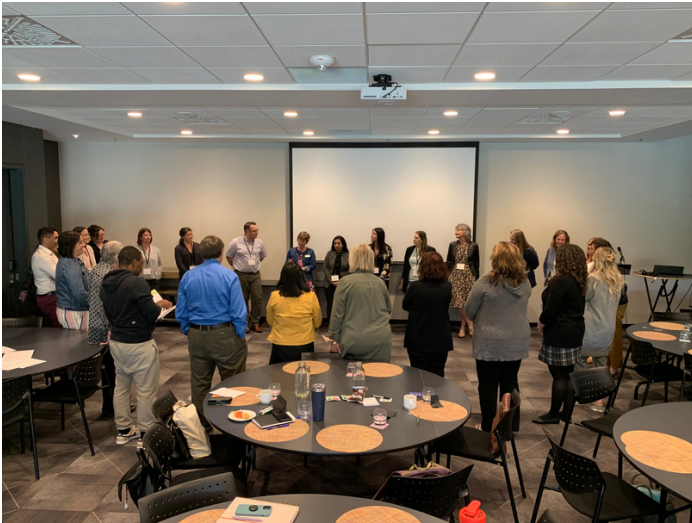
Graduation Challenge Day