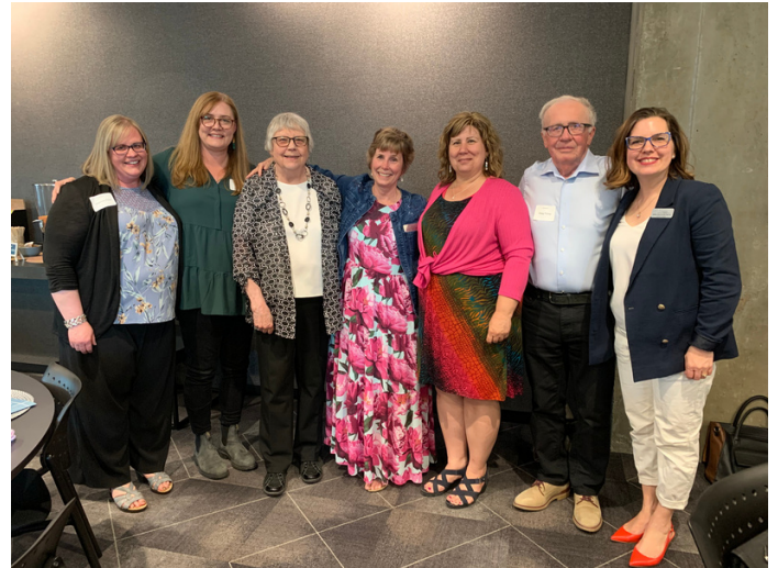
Past & Present Leadership Saskatoon Staff and volunteers