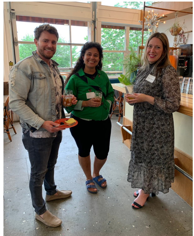
Alumni Networking Event