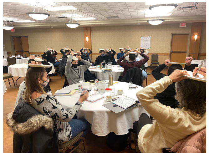
December Challenge Day