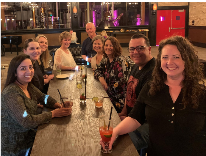
Mentors and Mentees at the Mentorship Networking Event